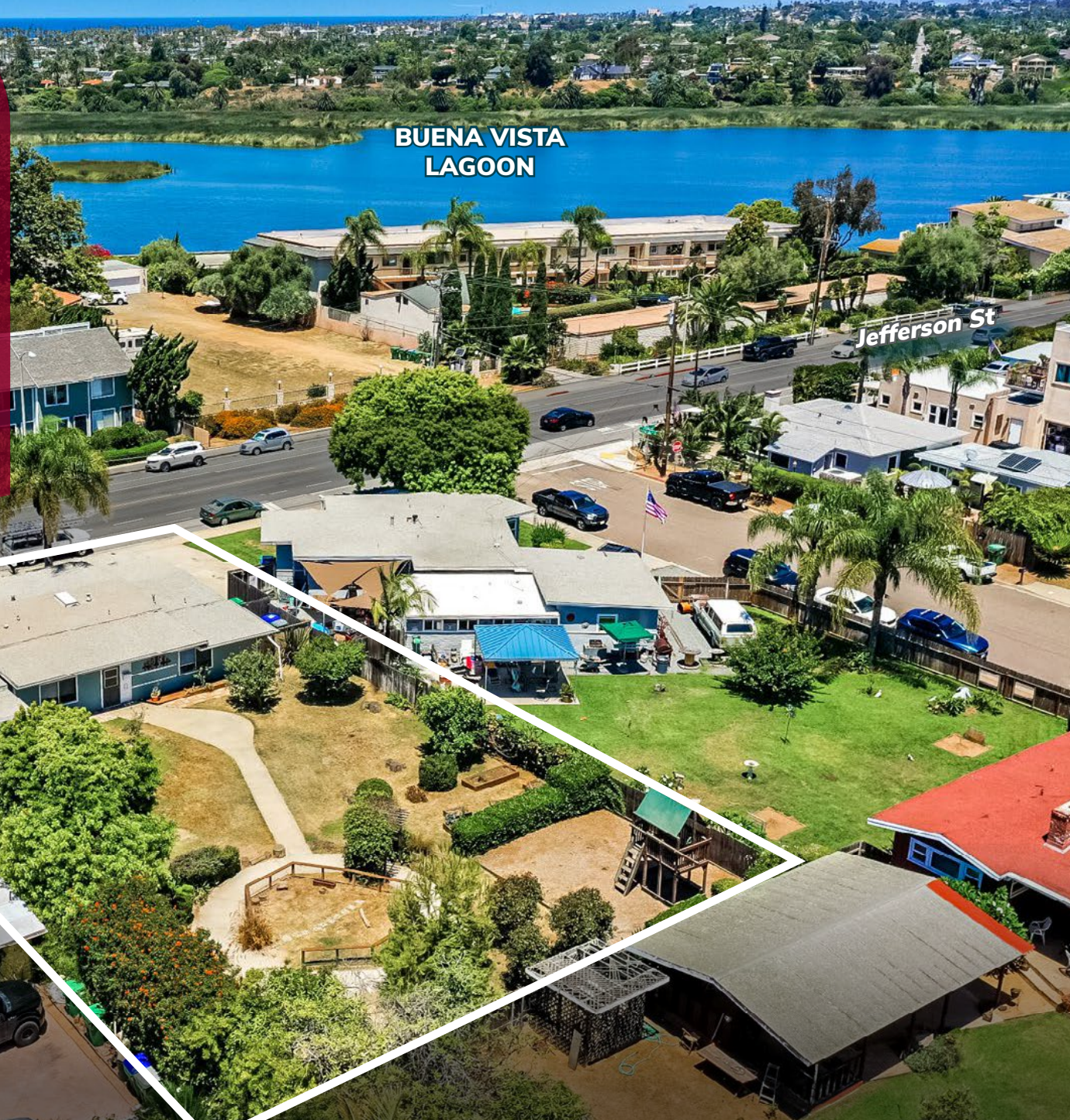
BUENA VISTA LAGOON