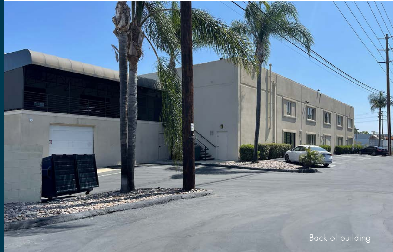
Back of building

Close proximity to many retail amenities