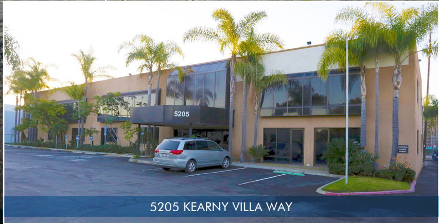
5205 KEARNY VILLA WAY