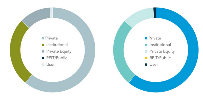
SALE BY SELLER TYPE

**'Sale by Buyer' and 'Sale by Seller' Data is comprised of data from the previous 12 months.