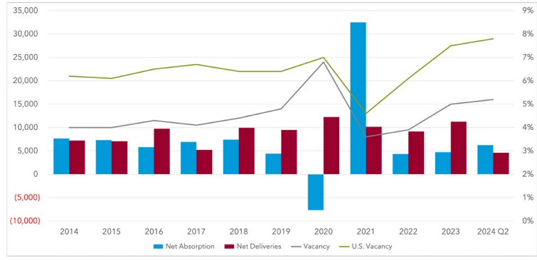
NET ABSORPTION, NET DELIVERIES, & VACANCY