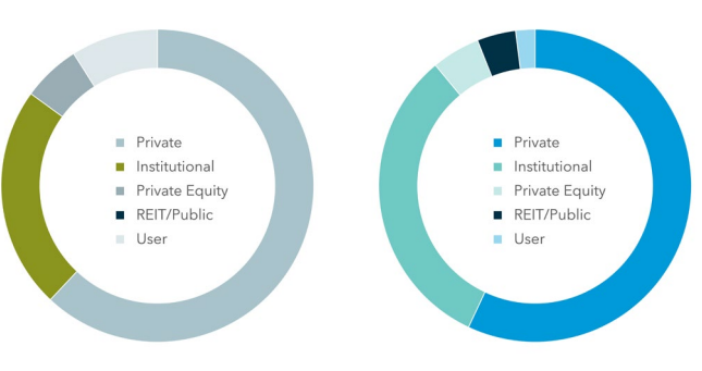
**'Sale by Buyer' and 'Sale by Seller' Data is comprised of data from the previous 12 months.